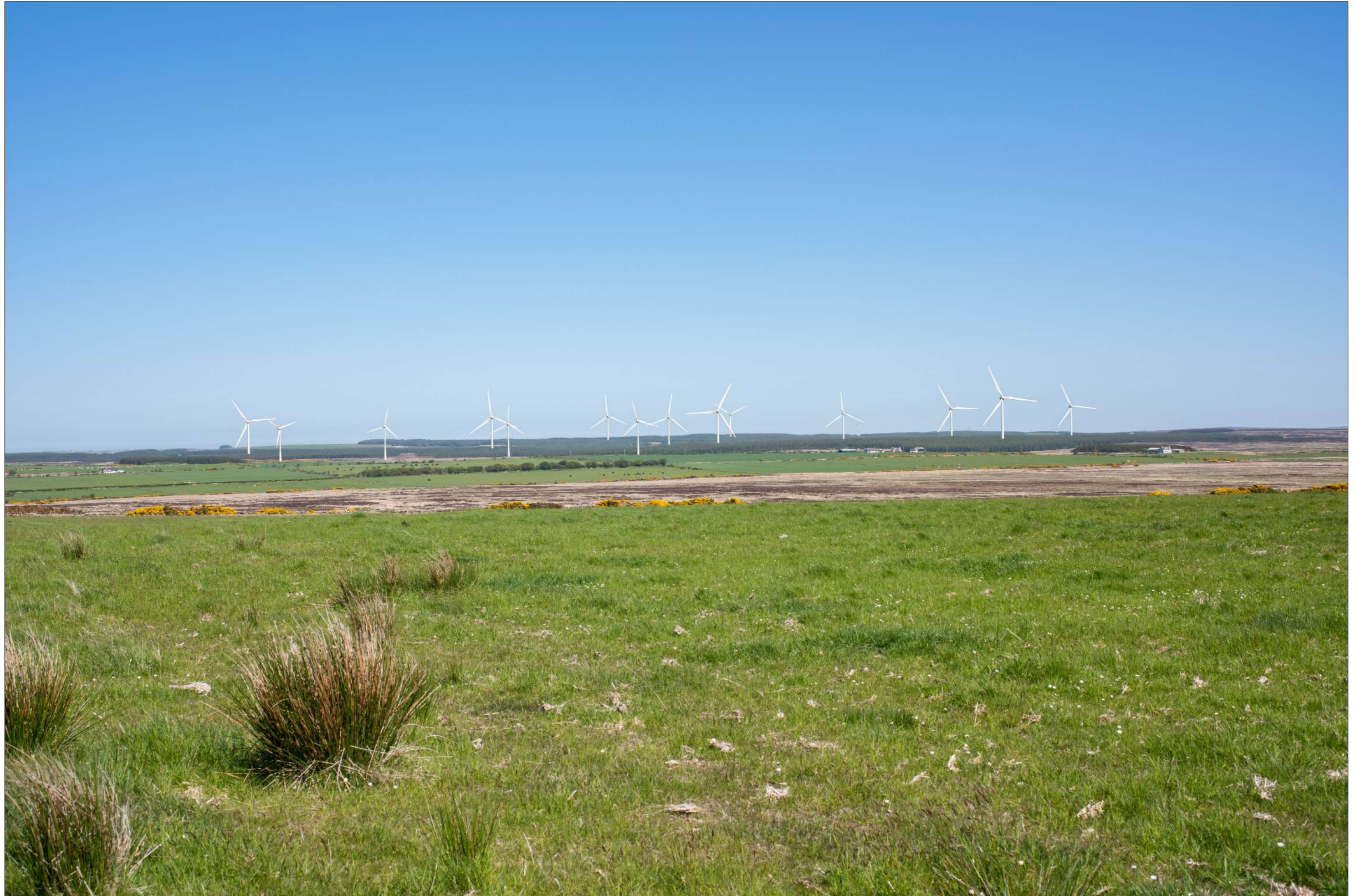
Figure: 7.24-THC-03 Viewpoint 11: Lochend

When viewed at a comfortable arm's length (approx. 500 mm), this printed image is representative of our detailed central vision, but is not representative of scale and distance.