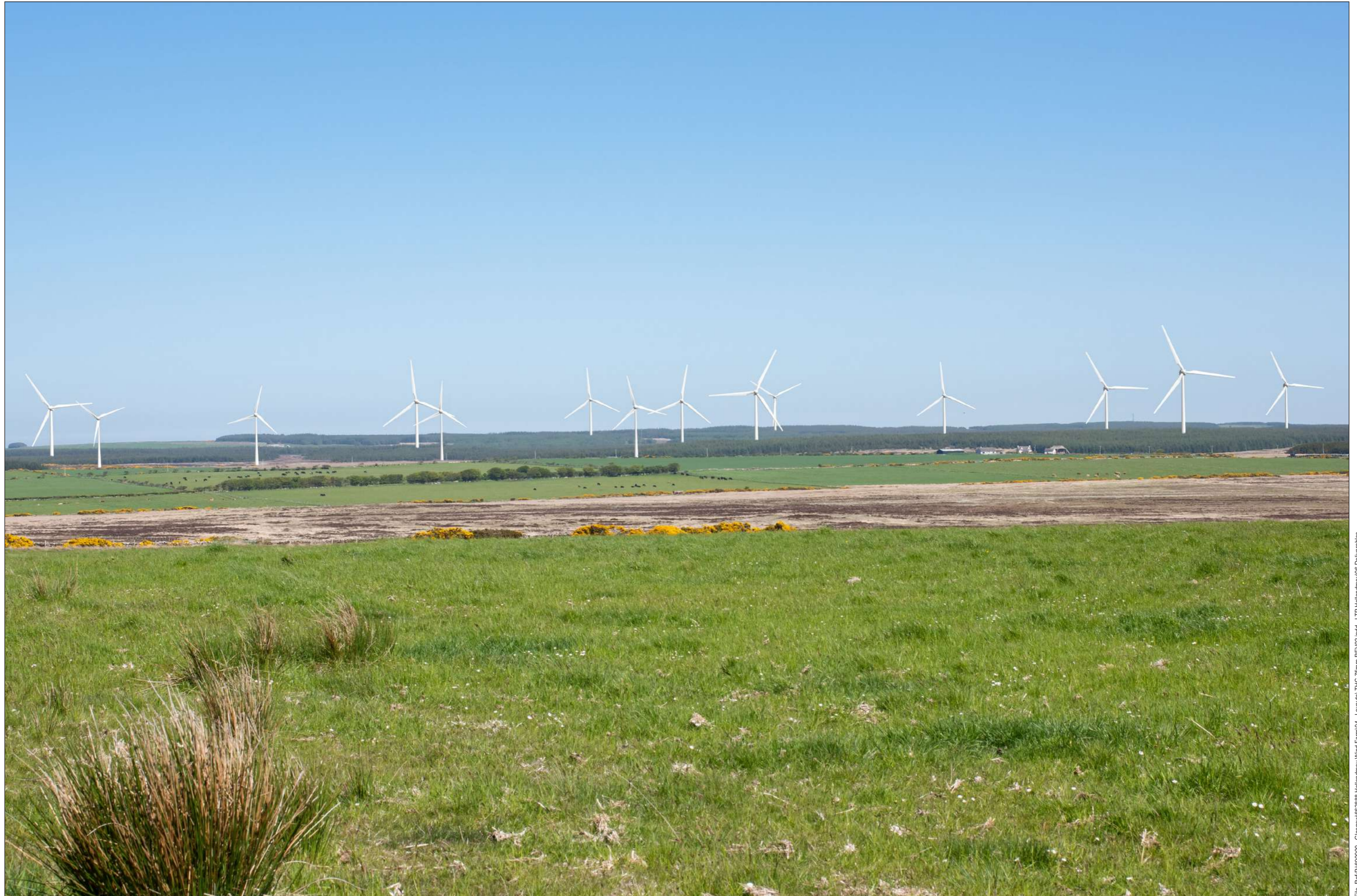
Figure: 7.24-THC-04 Viewpoint 11: Lochend

This image should be viewed at a comfortable arm's length (Approx. 500 mm)